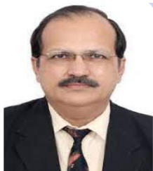
Shri Sanjay Pant DDG Standardization BIS